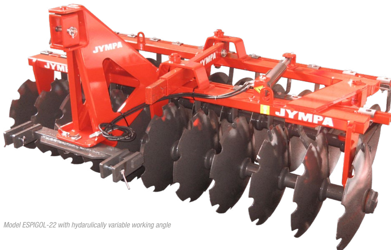
Model ESPIGOL-22 with hydraulicly variable working angle