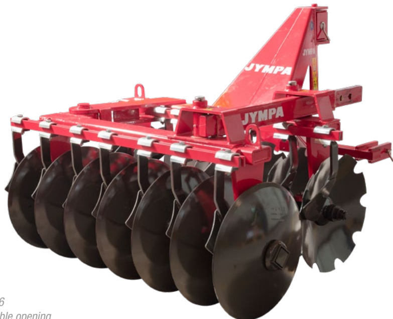
Model ESPIGOL-16 with manual variable opening